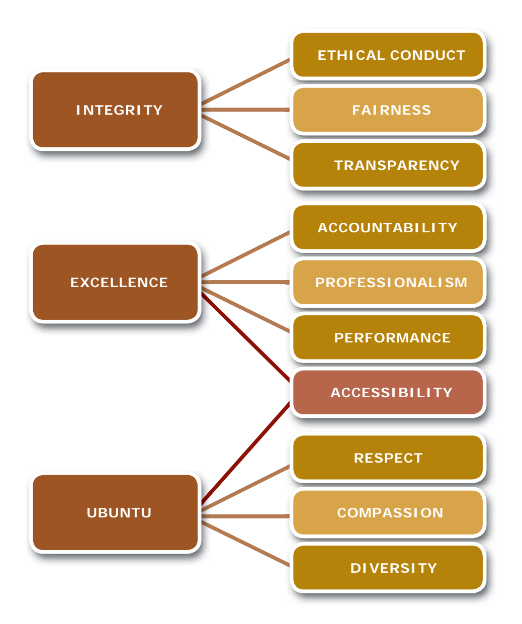
Figure 1: Values Framework for PSiRA